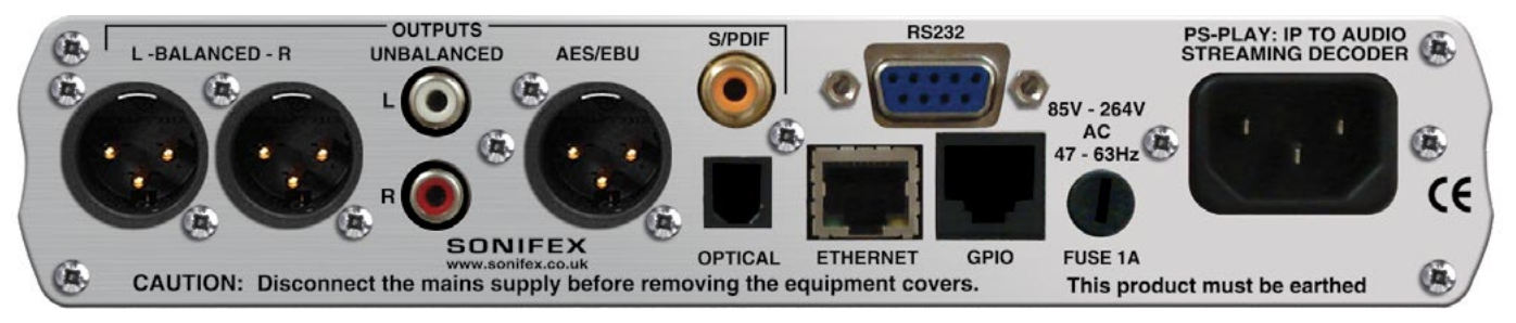
Fig 3-7: PS-PLAY Rear Panel

All audio connections are outputs on this unit.