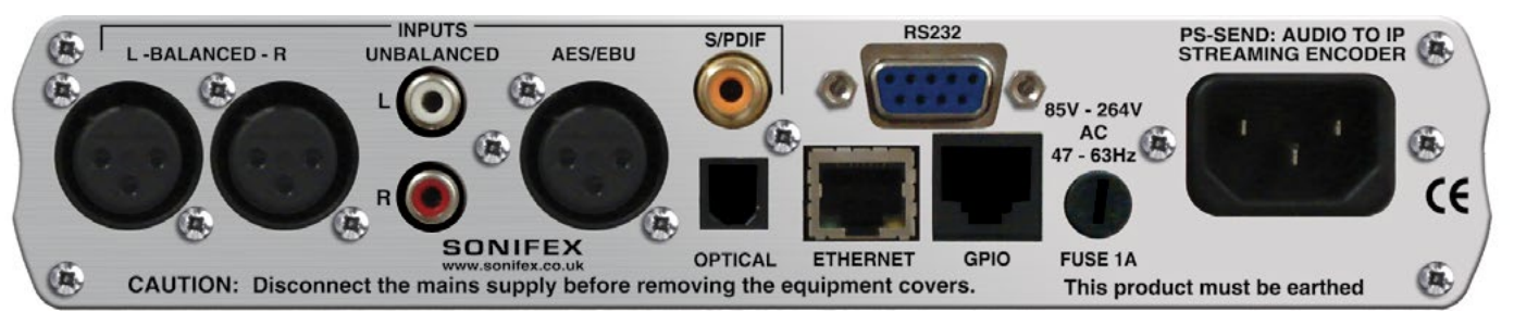
Fig 2-5: PS-SEND Rear Panel

All the audio connectors together with the ethernet, serial and GPI/O connectors are found on the rear panel of the unit. All the audio connections are inputs on this unit.