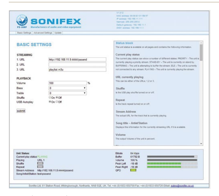
Fig 5-2: The PS-AMP Webpage