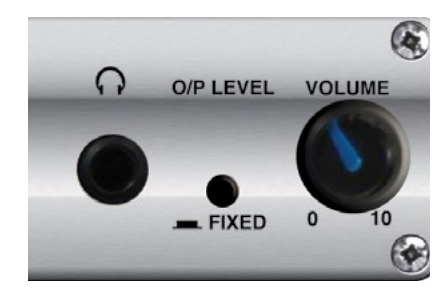
Fig 3-6: PS-PLAY Headphone Socket, Volume Control & Output Level Control