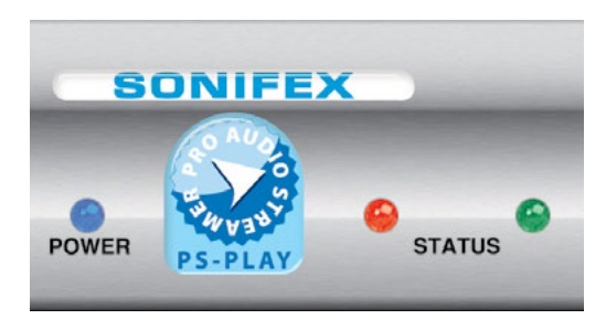
Fig 3-2: PS-PLAY Power & Status LEDs

The Reset button is used to restart the firmware and re-initialise the unit. Please use this button in the unlikely scenario of unit failure.