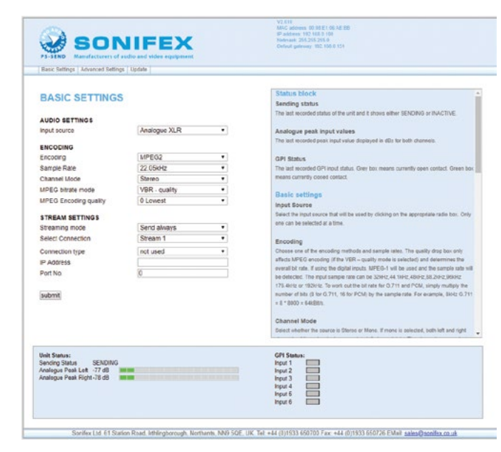
Fia 5-1: The PS-SEND Webpage