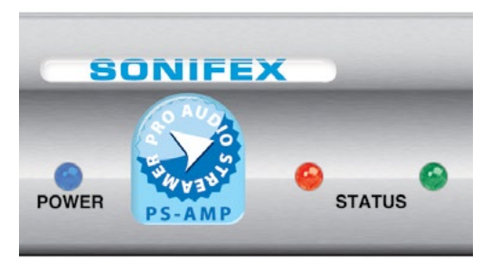
Fig 4-2: PS-PLAY Power & Status LEDs

There are two LEDS, red and green, which together indicate boot up errors and when data is being received. The LEDs have the following meanings: