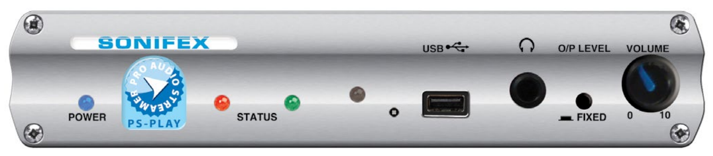
Fig 3-1: PS-PLAY Front Panel

The PS-PLAY is a freestanding IP to audio converter which is also available in a 1U rack-mount as the PS-PLAYS. It takes an IP audio feed and converts it to a number of simultaneous stereo outputs: balanced and unbalanced analogue audio, AES/EBU, S/PDIF & TOSlink digital audio outputs.