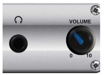
Fig 2-4: PS-SEND Headphone Socket & Volume Control