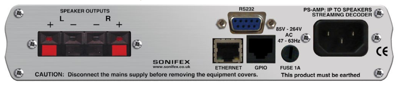
Fig 4-7: PS-AMP Rear Panel