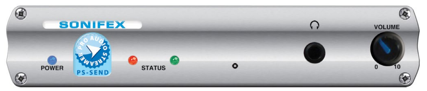
Fig 2-1: PS-SEND Front Panel

The PS-SEND is a freestanding audio to IP converter which is also available in a 1U rack-mount as the PS-SENDS. It receives audio from a number of user selectable external stereo sources including balanced and unbalanced analogue audio, AES/EBU, S/PDIF & TOSlink digital audio. Once an audio source is selected, the unit encodes the audio in real time and sends it to the network as an encoded stream. The audio stream can be distributed over an IP-based network to one or more PS-PLAY or PS-AMP units or other proprietary servers such as those for Icecast or Shoutcast.