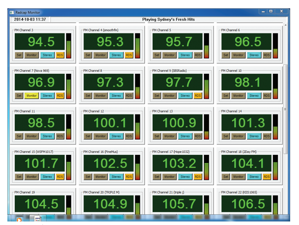
Fig 1-3: FM Radcap Monitor Screen

and twenty-four channel FM Radcap cards as well, and should be used in place of the earlier versions supplied with those cards.