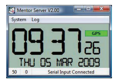
Fig 1-1: Mentor Server Window.

Mentor Server must be run as an administrator on Windows 8 otherwise you cannot connect to any NTP remote servers.