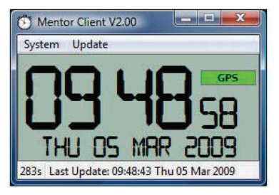
Fig 2-1: Mentor Client Window.