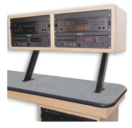
SOL-T12 Straight 2 x 6U Top Pod on Legs.