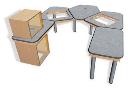
Split Mixer Furniture with SOL-MBCT Talks Table Desk Top.

U-shaped woodwork which allows space for up to 3 TFT monitor screens in the centre of the presenter's vision for automated playout, or editing, systems.