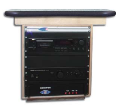
SOL-B12 12U Support Base Pod.

designed to house all of the technical equipment and to place frequently used items within easy reach of the presenter. There is a choice of top-pods to house the equipment -