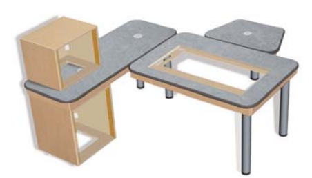
Single Mixer Furniture with SOL-MBT Talks Table Top.

information on the input channels available. A simple on-air studio package can consist of 1 high quality presenter microphone on an adjustable microphone arm, 1 guest microphone on a table stand, 2 pairs of headphones and a pair of small book-shelf speakers mounted on desktop speaker stands, such as the SOL-MS21 pair, behind the mixer.