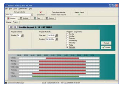
Program Record Screen.