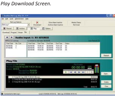
Play File Screen.