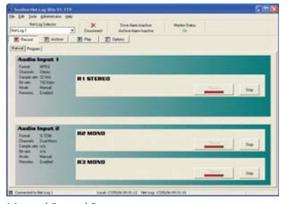
Manual Record Screen.