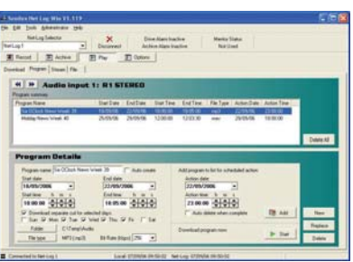
Play Program Screen.