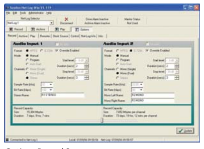
Options Record Screen.