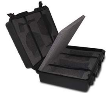
CM-CUTC Commentator Unit Transport Case.

CM-CUTC: This is an optional carry case to transport the CM-CU1 or CM-CU21 commentator unit along with 2 x headsets and 2 x ribbon mics.