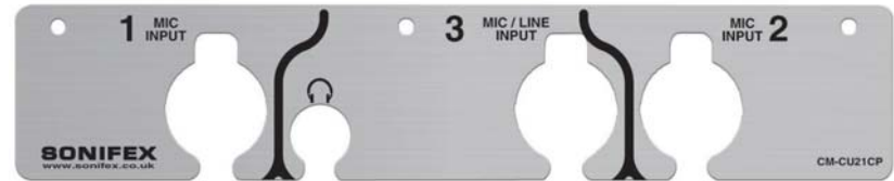
CM-CU21CP Commentator Unit Front Cover Plate.

An On-Air lock switch prevents the On-Air buttons from being accidentally deactivated and this can be over-ridden with a single push button on the rear panel for individual circumstances where an announcer needs to go off air. A talkback (T/B) gang switch links the operation of talkbacks A & B to make the talkback buttons easier to use by the announcers.