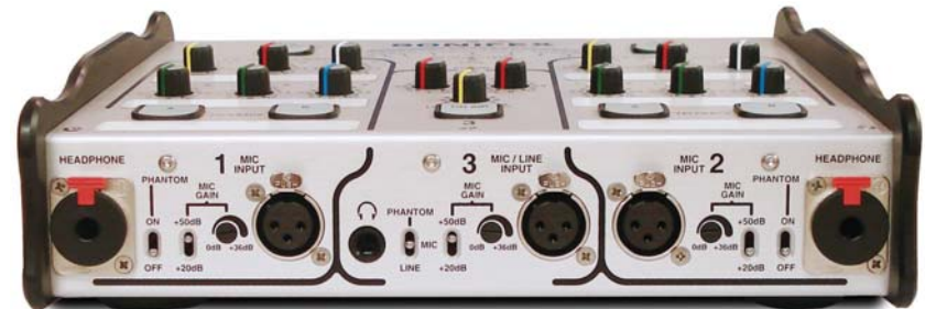
CM-CU21 Commentator Unit Front View.

A wide input gain range and switchable phantom power on each commentary