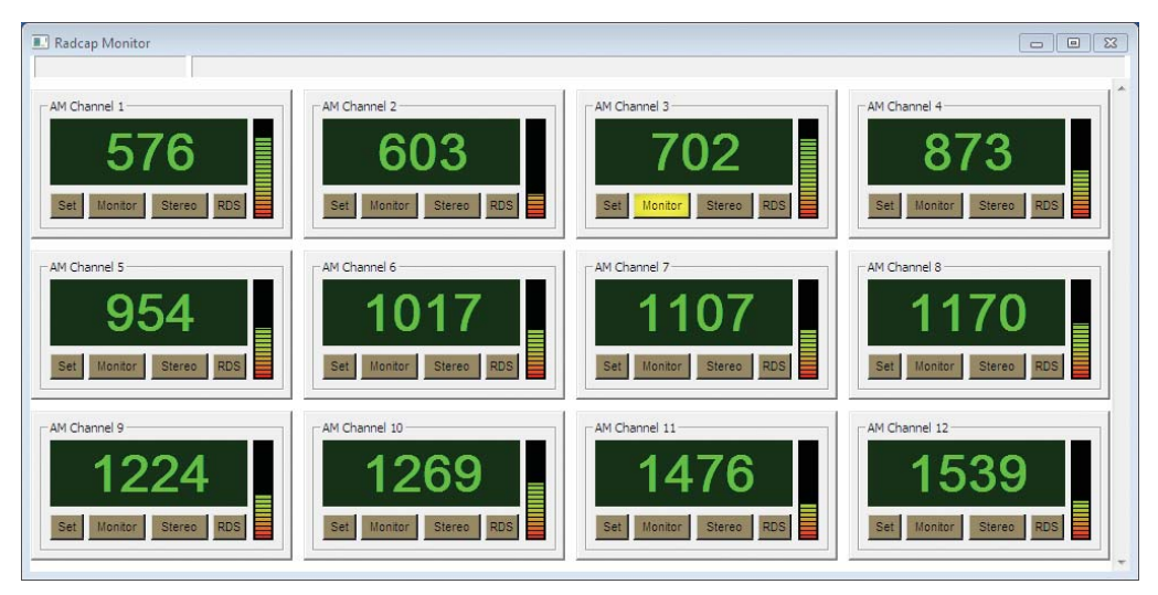
Fig 1-3: Radcap Monitor Screen

To run the program, insert the driver CD, click on Start – Run and type in d:\AM & FM Radcap\Tuner.exe where d: is the drive letter for the CDROM drive. To set the frequency of a station, click on the Set button for that station, type in the frequency (in kHz) and click on OK. To monitor a station, click on the Monitor button for that station. Note that there is a delay of about one second in the audio heard via this monitor, due to the amount of audio buffering used.