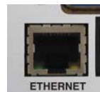
Fig 4-9: PS-AMP ETHERNET Port.