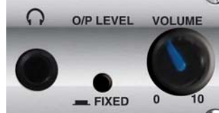
Fig 3-6: PS-PLAY Headphone Socket, Volume Control & Output Level Control.

The headphone output has its own volume control and has a maximum output level of +12dBu.