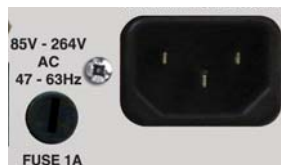
Fig 2-14: PS-SEND IEC Power Plug & Fuse.

The fuse socket is a where the anti-surge fuse 1A 20 x 5mm fuse is inserted. Please unplug the unit whenever opening this cover.