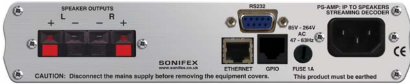
Fig 4-7: PS-AMP Rear Panel.