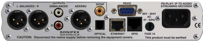
Fig 3-7: PS-PLAY Rear Panel.

All audio connections are outputs on this unit.