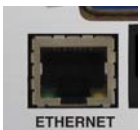
Fig 2-12: PS-SEND ETHERNET Port.