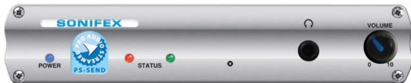
Fig 2-1: PS-SEND Front Panel.

Power to the unit is via a universal supply 85V - 264V fused IEC mains socket.