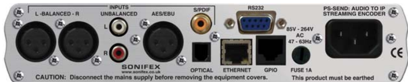
Fig 2-5: PS-SEND Rear Panel.

All the audio connectors together with the ethernet, serial and GPI/O connectors are found on the rear panel of the unit. All the audio connections are inputs on this unit.