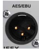
Fig 3-10: PS-PLAY AES/EBU Output.

Yellow LED: On power up, flashes periodically while waiting for a