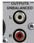
Fig 3-9: PS-PLAY RCA Phono Analogue Outputs.