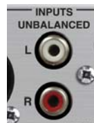
Fig 2-7: PS-SEND RCA Phono Analogue Inputs.