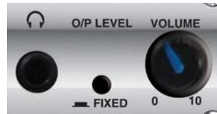
Fig 4-6: PS-AMP Headphone Socket, Volume Control & Output Level Control.