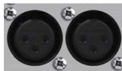
Fig 2-6: PS-SEND XLR Analogue Inputs.