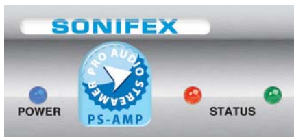
Fig 4-2: PS-PLAY Power & Status LEDs

There are two LEDs, red and green, which together indicate boot up errors and when data is being received. The LEDs have the following meanings: