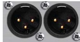
Fig 3-8: PS-PLAY Analogue Outputs