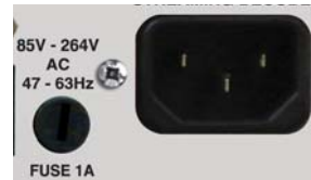
Fig 3-16: PS-PLAY IEC Power Plug & Fuse.

The fuse socket is where the anti-surge fuse 1A 20 x 5mm fuse is inserted. Please unplug the unit whenever opening this cover.