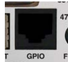
Fig 2-11: PS-SEND GPIO RJ45.