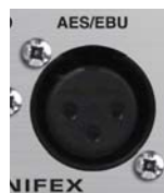
Fig 2-8 PS-SEND AES/EBU Input.

The signals on this connector should meet the IEC 60968 specification