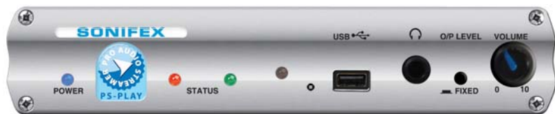
Fig 3-1: PS-PLAY Front Panel.

The rear panel has 2 x RJ45 connectors, one for the 10/100Mbit Ethernet interface and one for GPIO connections. The PS-PLAY has 2 output relay contacts which can be triggered remotely over IP from a connected PS-SEND unit. There is a 9 way D-type RS232 serial connection for control of the unit by automation systems and for firmware updates. The unit can be remote controlled via serial connection, TCP or UDP and remote management of the unit is also possible using SNMP traps.