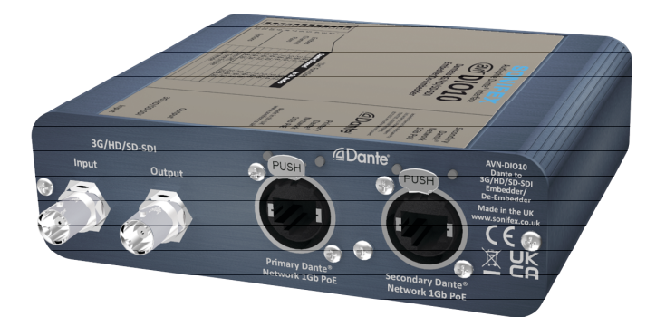
Fig 1-9: AVN-DIO Rear Iso View Shown without Accessories

Fig 1-8: AVN-DIO Front Iso View Shown without Accessories