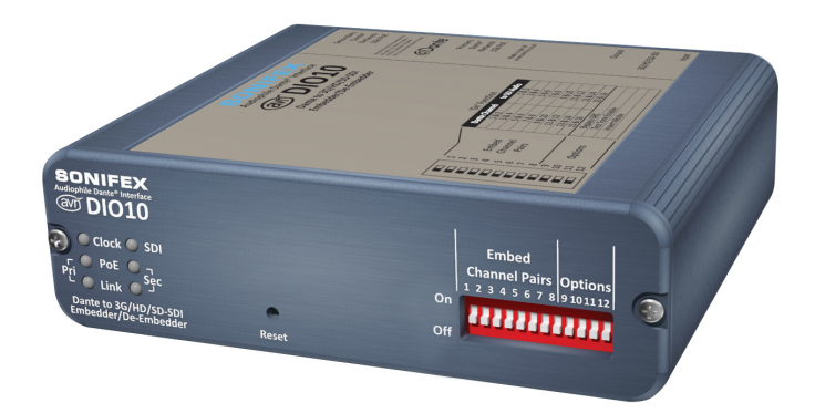
Fig 1-8: AVN-DIO Front Iso View Shown without Accessories

Fig 1-7: Iso View Shown with AVN-DIOMT Deskbar Attached