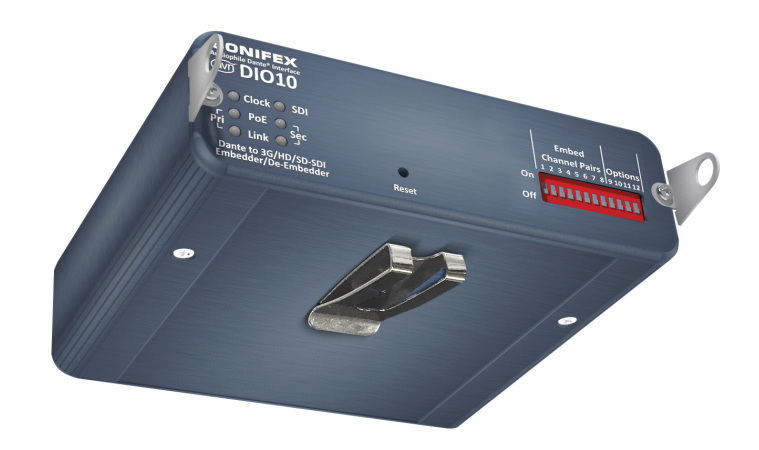
Fig 1-6: AVN-DIO Iso View Shown with AVN-DIOBT Brackets and Belt Clip Attached