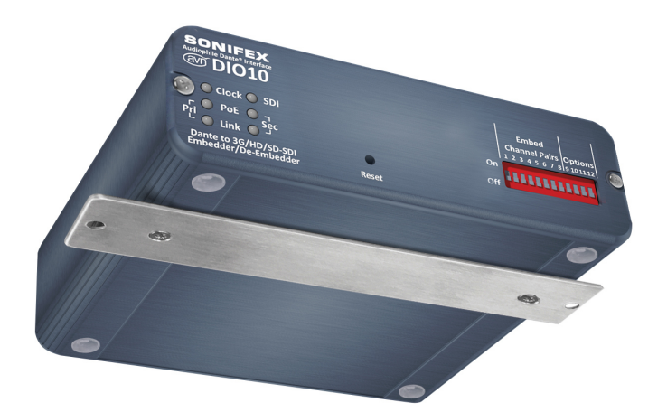
Fig 1-7: Iso View Shown with AVN-DIOMT Deskbar Attached