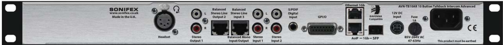
AVN-TB10AR Rear View.