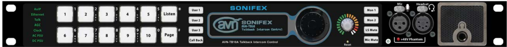
AVN-TB10AR Front View.