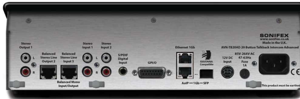
AVN-TB20AD Rear View.